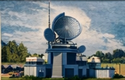
SURVEILLANCE & RADAR HUBS