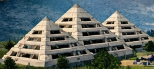
40,000 PILLBOX BUNKER UNITS