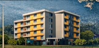
POPULATION & YOUTH HOUSING

SECURE EUROPE'S FUTURE: A PROACTIVE PAN-EUROPEAN DEFENSE NETWORK