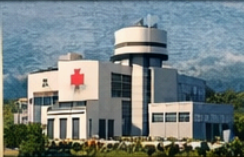
TRAINING & MEDICAL CENTERS